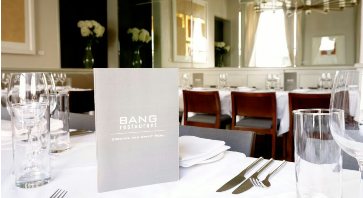
The Scott Tallon Dining Room