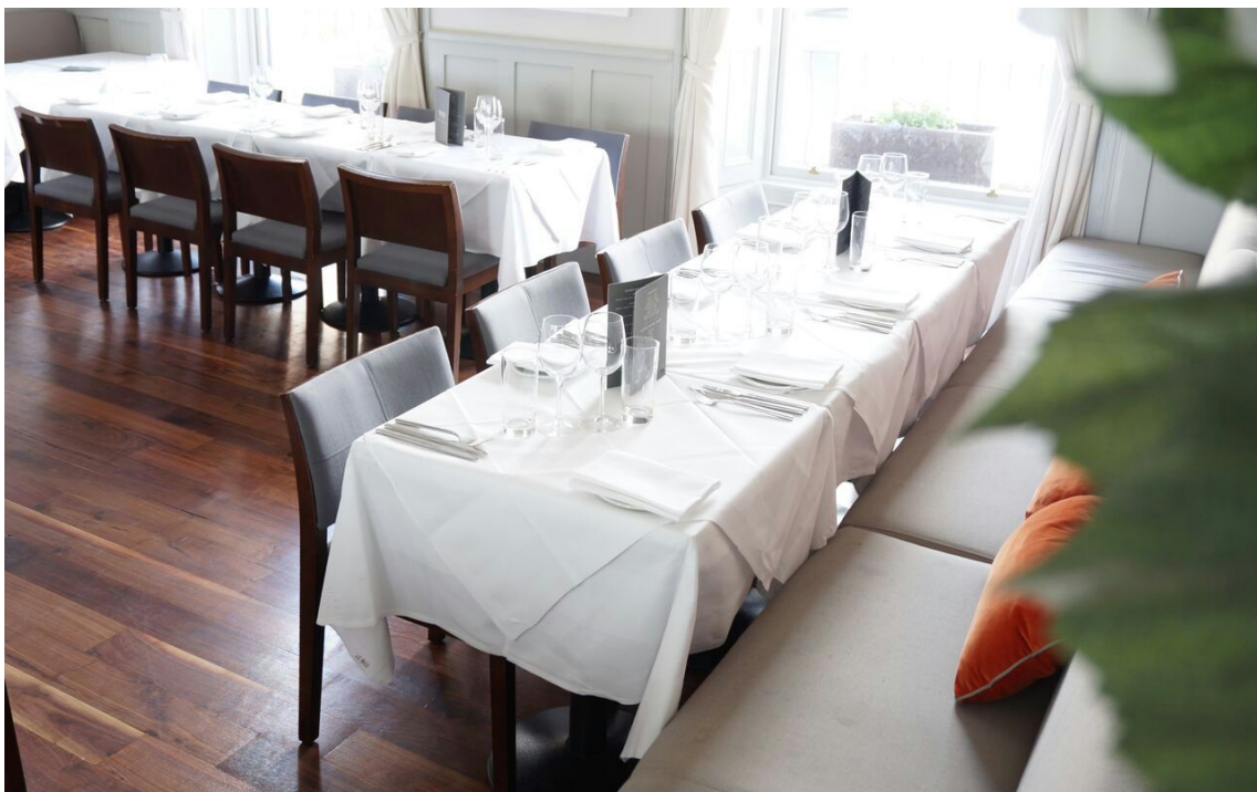
The Scott Tallon Dining Room

'The Scott Tallon Private Room' is a private room on the first floor which accommodates up to 44 guests seated, a horseshoe shaped table can accommodate up to 20 guests or up to 50 standing for a canapé reception. Decorated in a contemporary style with soft golds and tangerines the room has been described as one of the most stunning rooms in the city. A beautiful, central, handmade wheel chandelier lights the room and is reflected by a wall of bevelled mirrors.